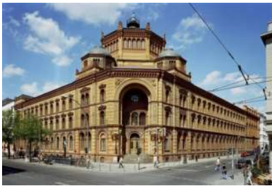
Historical Post Office, Berlin 28.000 m 2 GFA