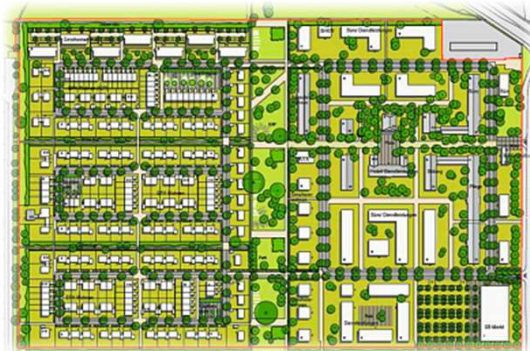
Former Freiherr-von-Fritsch Barracks, Hannover 269.000 m 2 plot size