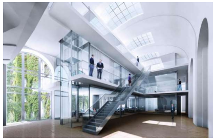
Reconstruction of the old Groterjan Brewery Berlin, 2.000 m 2 GFA