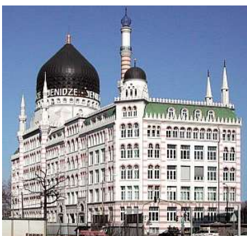
Yenidze, Dresden 11.000 m 2 GFA