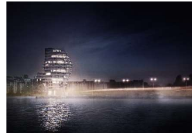
Deck One, Berlin Condominiums, 11.000 m 2 GFA