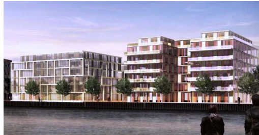
East Harbor, Berlin 21.000 m 2 GFA