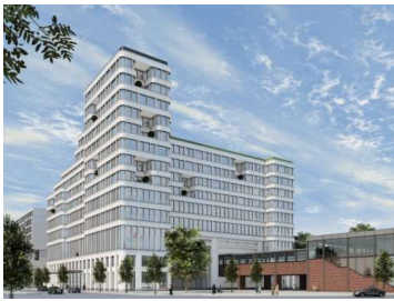
Premium Health Care & Hotel, Berlin 28.000 m 2 GFA