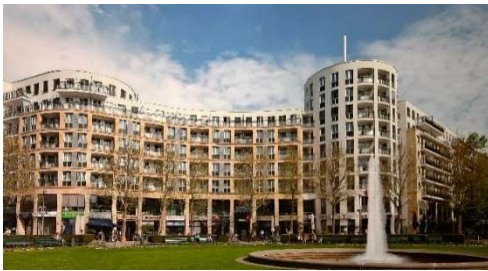
Prager Platz, Berlin Hotel, Fitness, Retail, Housing 28.000 m 2 GFA