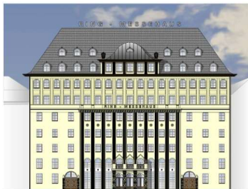
Ringmessehaus, Leipzig 36.000 m 2 GFA