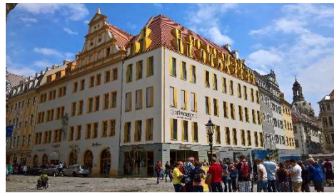
Palace Hotel, Dresden 17.000 m 2 GFA