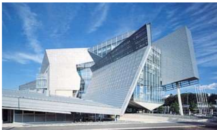
Alpen Adria Zentrum, Klagenfurt 27.983 m 2 GFA